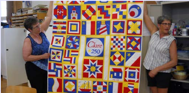
June 27, 2018 Clare 250 commemorative quilt

Members of la Guilde Acadienne de Clare designed a dazzling quilt using the colours of the Acadian flag to commemorate Clare's 250 th anniversary. The quilt was unveiled during a meeting of the guild on June 27 and was then proudly displayed as the focal point of the Quilt Expo at Église Sacré-Cœur in Saulnierville in July.