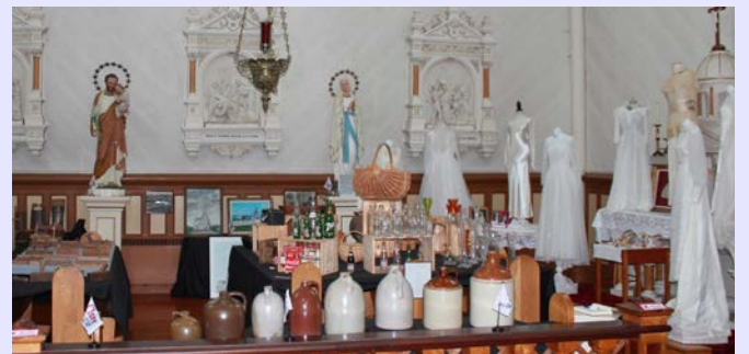
August 1 to 17, 2018 Collection Communautaire du 250 e The exhibit, which was held at Église Sainte-Marie, consisted of a collection of objects from then and now that depict life in Clare. The objects were donated by community members for the duration of the exhibit.

Guests were treated to a sunny day at Smugglers Cove Provincial Park in Meteghan. There were activities for participants of all ages, including a performance by the group Pieds à Terre , children's activities, bouncy castles and a barbecue. In all, 700 people attended the celebration. The day ended with a fireworks display behind the Villa Acadienne in Meteghan.