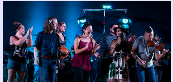
July 28, 2018 Opening concert for the Festival acadien de Clare Clare 250 was a sponsor of the opening concert for the 63 rd edition of the Festival acadien de Clare . The concert, at Université Sainte-Anne, paid tribute to the musicians and music from Clare. More than 25 artists from the region performed.

Members of la Guilde Acadienne de Clare designed a dazzling quilt using the colours of the Acadian flag to commemorate Clare's 250 th anniversary. The quilt was unveiled during a meeting of the guild on June 27 and was then proudly displayed as the focal point of the Quilt Expo at Église Sacré-Cœur in Saulnierville in July.