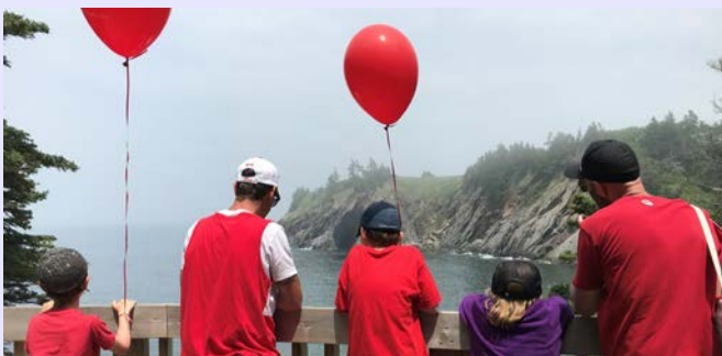
July 1, 2018 Canada Day and Clare 250 celebration

Guests were treated to a sunny day at Smugglers Cove Provincial Park in Meteghan. There were activities for participants of all ages, including a performance by the group Pieds à Terre , children's activities, bouncy castles and a barbecue. In all, 700 people attended the celebration. The day ended with a fireworks display behind the Villa Acadienne in Meteghan.